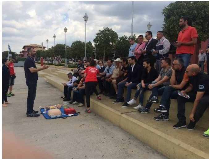
Man at Sea - CPR

The training was provided by Flisvos Marina in cooperation with the Hellenic Lifeguard Academy (ENAK) on May 18 th , 2016. The training focused on basic life support techniques, such as the Primary Assessment, CPR and rescue breaths. The training included rescuing theory and hands-on practice using a CPR mannequin, so that the participants would acquire some basic knowledge and be able to take action in an emergency. Also, the use of an Automatic External Defibrillator (AED) was also demonstrated. The training attended marina's personnel, yacht crews, shop employees and marina's visitors.