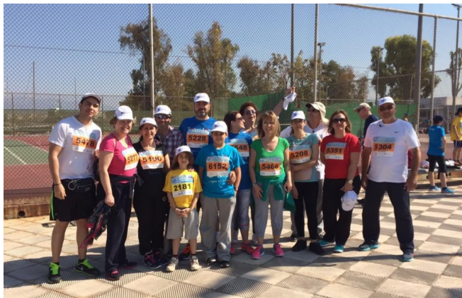
Poseidon Half Marathon

From 23rd to 24th of April 2016, a charity Bazaar “The Smile of the Child” was held at Flisvos Marina with great success. The Bazaar featured Easter products, and at the same time informed visitors about the purpose and actions of the Association.