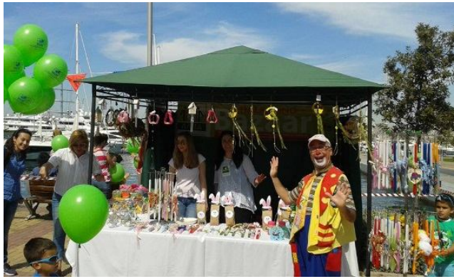
ALMA Easter Bazaar

The Easter Bazaar of ALMA, Panhellenic Association of Adapted Activities, was held at Flisvos Marina, on 17 April 2016 for the twofold purpose of fund aid by selling Easter objects and informing visitors about the aims of the Association.